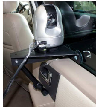
WINDOW MOUNT IN DROP CAR